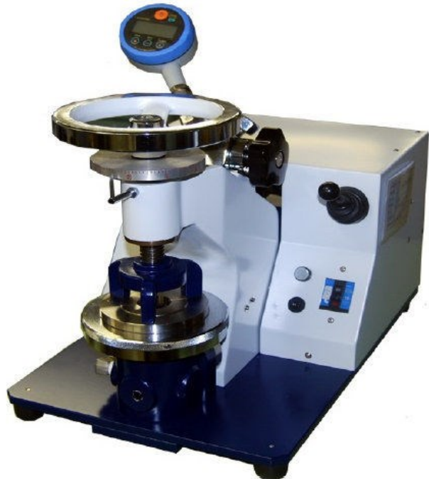
Digital pressure gauge (Option)