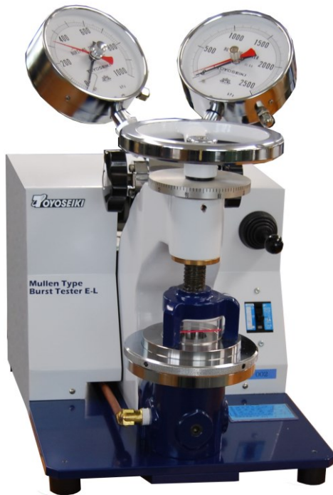
Analog pressure gauge (Standard)